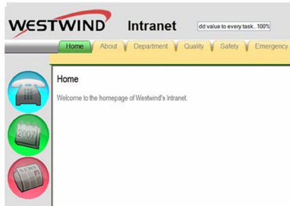
Graphical User Interface Template