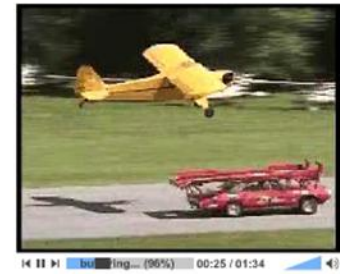
Wright Attitudes Novelty Airplane Acts