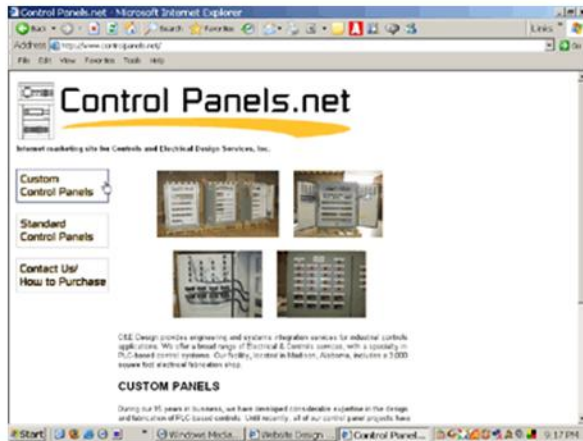
Business Websites (Including Engineering) www.controlpanels.net